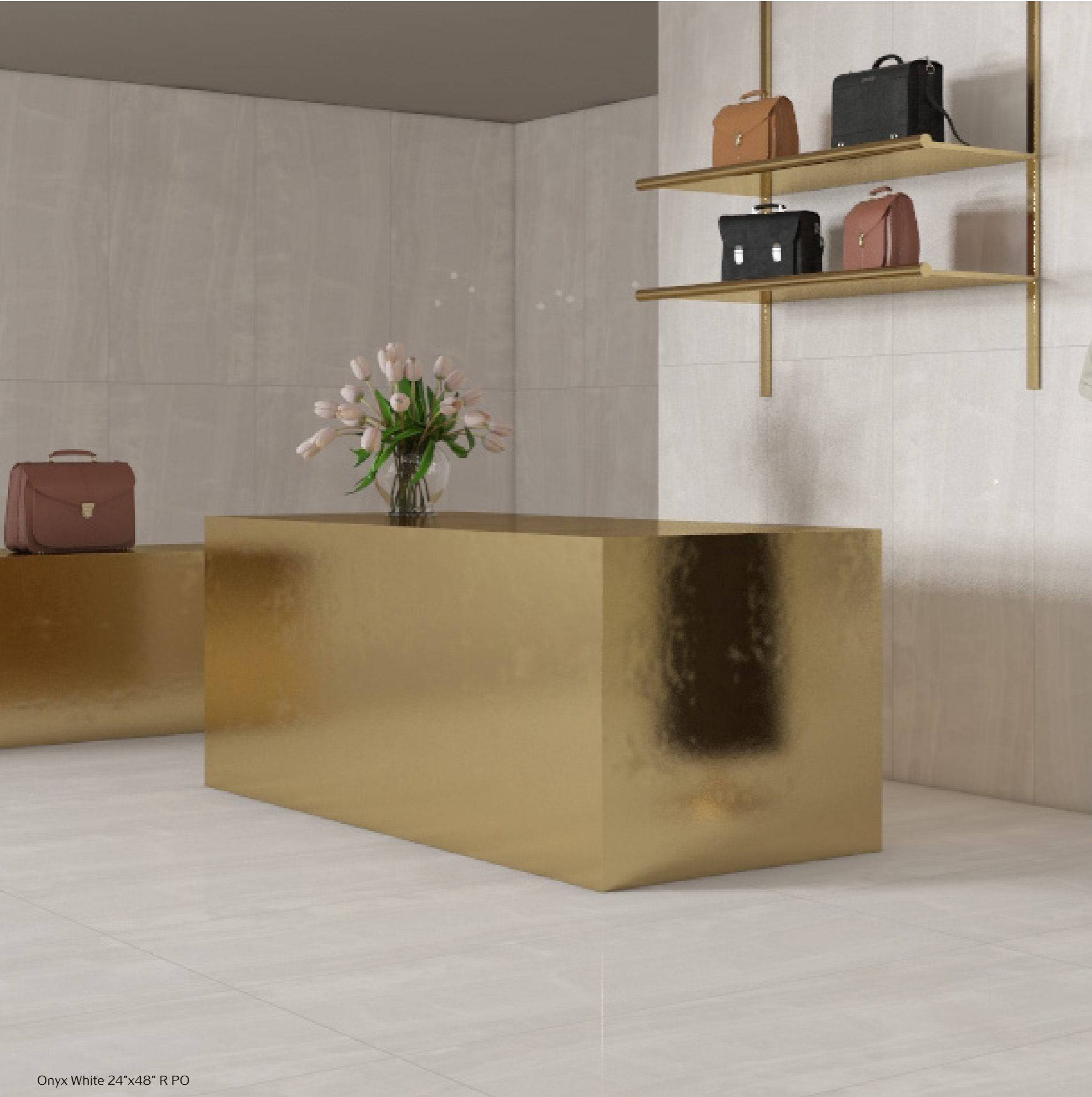
Onyx White 24"x48" R PO

The Onyx series gathers light with warm nuances of waves that run smoothly over the surface of this porcelain tile, which create a feeling of spaciousness and luminosity.